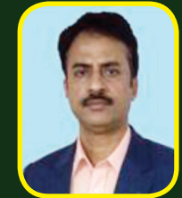
Er Susanta Dutta Former Deputy Secretary PWD, Govt. of Tripura

Registration is a must for attending the Webinar and for free registration, you are requested to register using the link: https://zoom.us/webinar/register/WN_wikZjg_cShSyoVdX2ALwFw