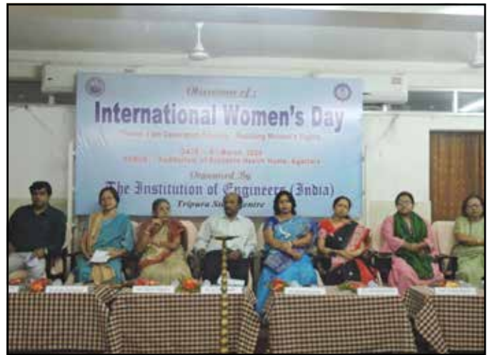
Glimpses of Dais