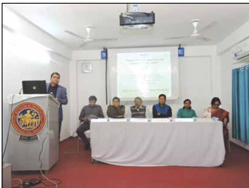
Glimpses of Dais