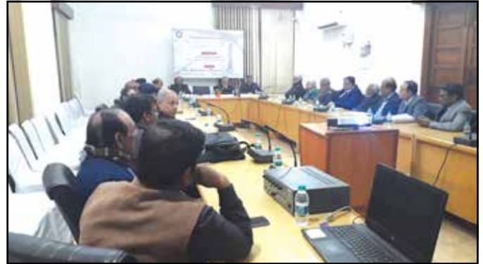
Glimpses of Members present in the occasion

IEI, Tripura State Centre jointly with IEI, Delhi State Centre organized a Seminar on “Retrofitting of Structures” on 8th January, 2020 in a befitting manner at Seminar Hall of IEI, Delhi State Centre as a part of Joint Venture Programme.