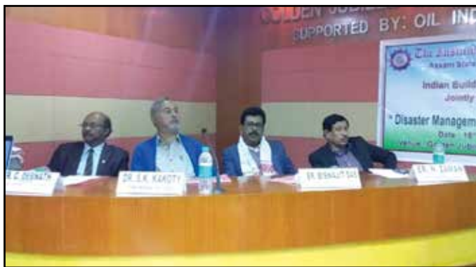
Glimpses of Dais