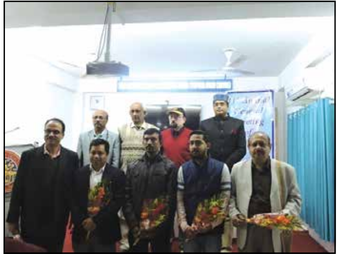
New Committee for the Sessions 2019-20 & 2020-21