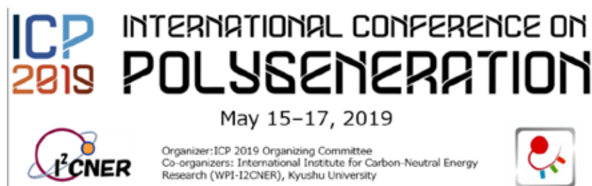
Figure 1. Caption of figure showing the conference title.

Figure captions should be Times New Roman with 10-point font size. All Figures and Figure captions must be centre-aligned. Do not give Figure caption on top of the Figure, instead, provide Figure captions at the bottom of the Figure. All Figures must be cited in the text [3]. Provide high resolution image of the Figure, preferably, using the enhanced meta file (.emf) format while the layout of all Figures should be “in line with the text”. Avoid using separate textbox for the Figure captions. If the file size becomes more than the allowable size for upload, the Figures may be compressed using resolution of 150-200 dpi [2,3]. Figure 1 shows the example on the style of the figure and the figure caption.